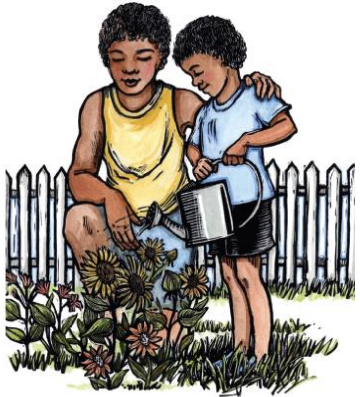
Conversing with family about how God is acting in our lives can help us more readily see God within our daily routines.

These moments when we feel God breaking through the ordinary become more apparent when we take time to notice them. You might write down one thing for which you are grateful each day. You might take five minutes to review the day's events to see where God's presence was most apparent. Over a meal with the ones you love, already a place of sacred encounter, you might converse about how God is acting in each of your lives in ways big and small. Making this a part of your regular family routine can yield big results in terms of seeing God's action bursting through the ordinary because, in large part, we only notice what we are looking for.