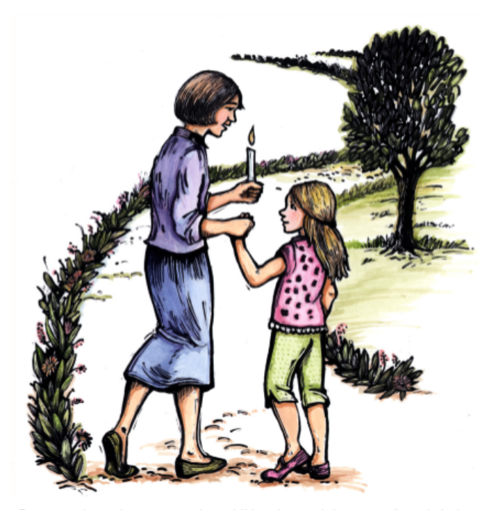
Parents and grandparents can show children how to bring prayer into their day.

Help children understand that prayers to God are no more limited to certain times or wordsthan any relationship is. Saying, "God, help me with my test" or "Help Grandpa get better" are prayers. When afraid, we can pray to God for help. When we see someone in need, we can pray that God will be there for them through other people. Model this for your chil-