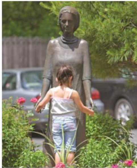
By learning about the saints, children will discover that there are many ways to follow Jesus.

Children love to hear stories of the saints. These ordinary men and women who lived extraordinarily inspire them,