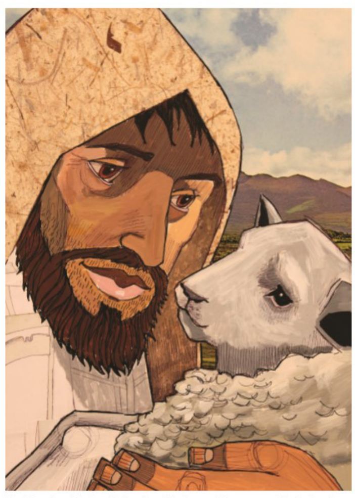
The Gospel on the Fourth Sunday of Easter provides an opportunity to show children how God lovingly cares for his children.

Place on your dinner table the figures of the baby Jesus and the shepherds from your crèche. Share with your children that, while Jesus lived, shepherds were social outcasts. At night